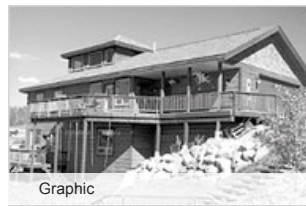
Three for Sale

not. Construction of several subdivisions that appeal especially to vacation buyers seeking low-maintenance houses and clublike services has changed that. And a once potentially treacherous drive over the 11,300-foot Berthoud Pass is less so, thanks to road improvements.