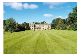
Tallantire Hall Great Britain, EU The quintessence of English property ownership...