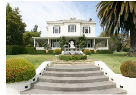
See what's on the market in Sonoma...